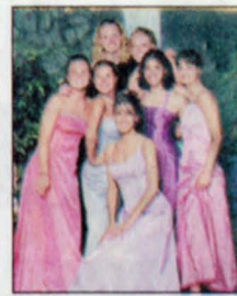
Abby's Closet once again giving away gowns — See Page B2